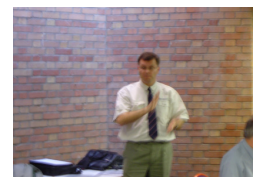
For more information contact

Participants will be equipped to sail as ICMA Sailing Chaplains. They will understand the challenges of life at sea and living in a confined environment. They have an insight in disaster management and can contribute to crisis management on board.