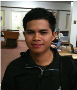
(Young Filipino seafarer only 19 years of age!!)