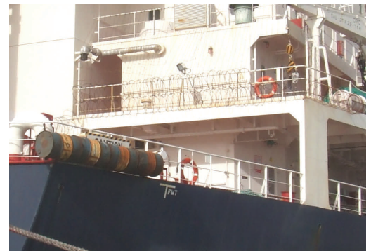
(Installation of drums and razor wire for protection against pirates of M/V Aristus 2)