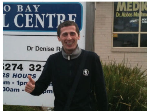
(Russian seafarer finally happy to clear his worries about his health, after seeing the local doctor)